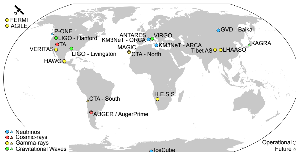
Figure 1. Earth map indicating the location of a selection of multimessenger observatories that are either currently operating (circles) or planned (triangles). Satellites are depicted outside to the map.

event for a given observatory, the false alarm rate, or the probability of the event to be of astrophysical origin.