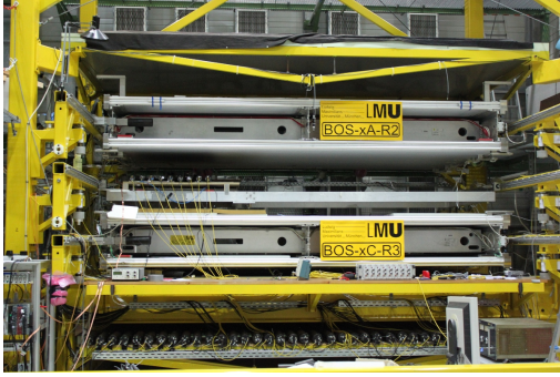
Figure 2. The LMU cosmic ray facility.