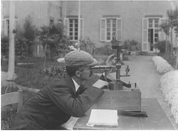
Figure 1: Domenico Pacini [14].

pretation was that radioactivity was mostly coming from the Earth's surface [5], although the most precise measurements, those by Gockel who reached a height of 3000 m, where not completely consistent.