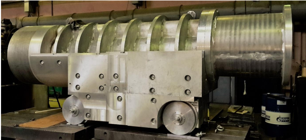
Figure 3. The assembled UCN source