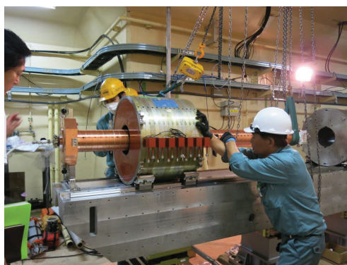
Figure 3: LAS structure insertion into DC solenoid.

We use the large aperture S-band (LAS) accelerating structures in the positron capture section since their aperture diameter (30 mm) enlarge the transverse phase space acceptance twice compared to that with the conventional S-band structures (21 mm). Details of the LAS structure is described in Ref [6]. In the capture section for SuperKEKB, six LAS structures are installed inside the DC solenoid modules as shown in Fig. 3.