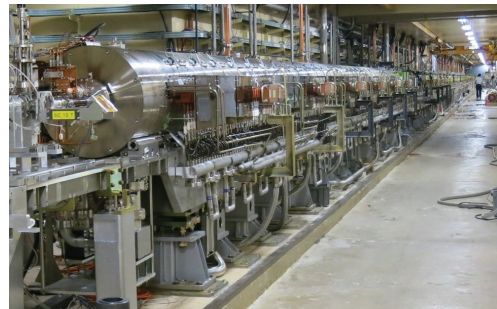
Figure 1: SuperKEKB positron capture section.

components and a preliminary positron beam performance are described in the following sections.