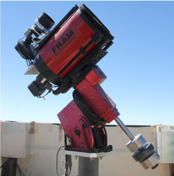
Figure 1. FRAM at the Pierre Auger Observatory.

which will span 10\text{ km}^2 (as opposed to the 1\text{ km}^2 of the northern site), installation of more FRAMs could be beneficial in order to minimize the distance between to the nearest FRAM for as many CTA telescopes as possible, as this distance introduces possibly an uncertainty in the measurement in case of horizontally non-uniform atmosphere or scattered clouds. As an added bonus, with more FRAM devices, we can attempt to perform stereoscopic reconstruction of the clouds' positions in order to estimate their height (but it should be noted that the feasibility of this has not been tested in practice yet).