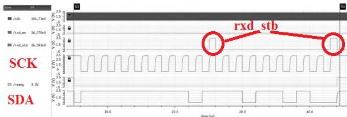
Fig. 3. The result of the simulation of data reception via the I2C interface

Fig. 3 is a timing diagram obtained during the simulation of data packet transmission for IC over I2C interface, where the transmission starts at 1.5 \mu s and ends at 46 \mu s.