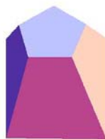
Figure 5. A typical cell of the dual polytope of the grand antiprism.

The typical cell of the dual polytope has 14 vertices with faces of 4 pentagons, 4 kites and 2 isosceles trapezoids as shown in figure 5.