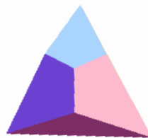
Figure 6. A typical cell of the dual polytope of the snub 24-cell.

Another interesting semi regular polytope is the snub 24-cell. The snub 24-cell [18] consists of 96 vertices S = I - T = \sum_{i=1}^4 p^i T with the symmetry group \left( \frac{W(D_4)}{C_2} \right): S_3 = \{[T, T] \oplus [T, T]^*\} of order 576. Its 144 cells consist of 24 icosahedra and 120 tetrahedra. The dual of the snub 24-cell has the vertices T \oplus T' \oplus S' with S' = \sum_{i=1}^4 \oplus p^i \bar{p}^i T' where p^\dagger is obtained from p by exchanging \tau \leftrightarrow \sigma . One cell of the dual polytope is a solid with 8 vertices as shown in figure 6.