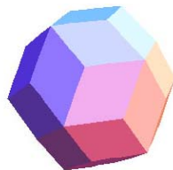
Figure 4. The rhombic triacontahedron.