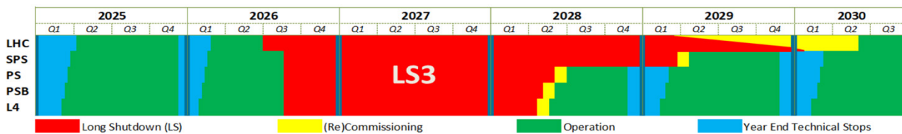
Figure 3: LS3 period.