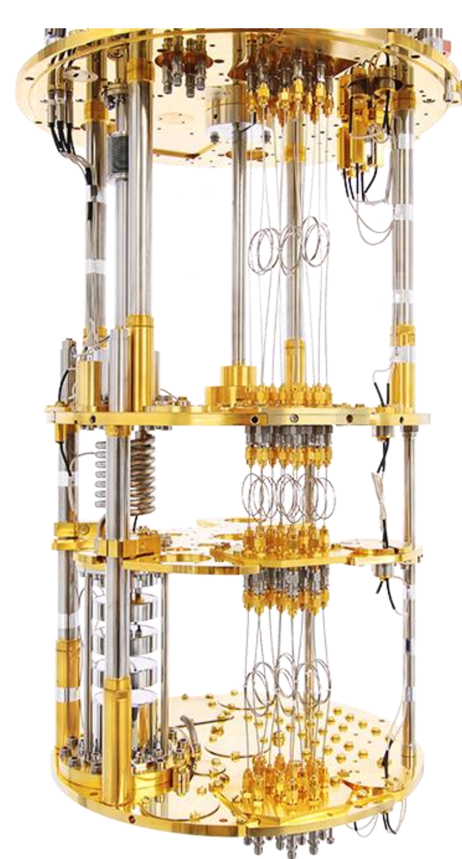
The inside of dilution refrigerator that provides continuous cooling to temperatures as low as 2 mK

( https://www.hybridquantumlab.com/new-blog/2019/1/3/santa-brings-lhqs-new-ld400 )