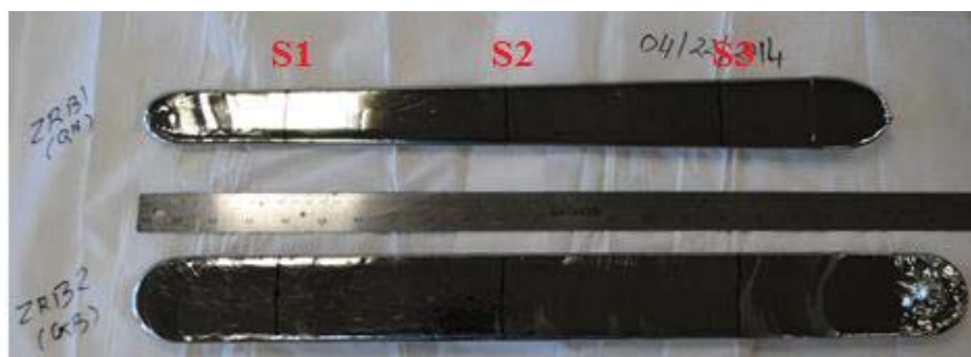
Fig. 3 Zone-refined ingots from quartz (top) and graphite (bottom) boats.

After zone refining in the graphite boat, the impurity level of the ingot was \sim 10^{12} \text{ cm}^{-3} , which was an improvement by factor of about 100 compared to the raw materials. The resulting material was p-type material as shown in Fig. 4a. After zone refined in quartz boat, the impurity level of all of samples reaches \sim 10^{11} \text{ cm}^{-3} as shown in Fig. 4b, which was a further improvement by a factor of about 10 compared to the zone-refined ingots in the graphite boat alone. Because boron and aluminum are acceptor impurities, while phosphorous is a donor impurity, p-type material means that the dominant impurities after zone refining were boron and aluminum.