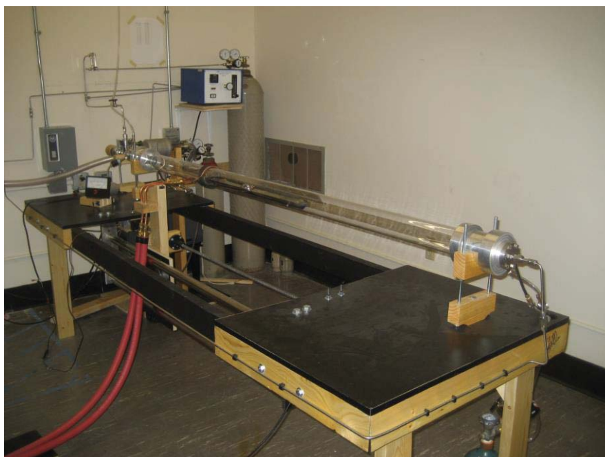
Fig. 2 SDSM&T zone refining unit.