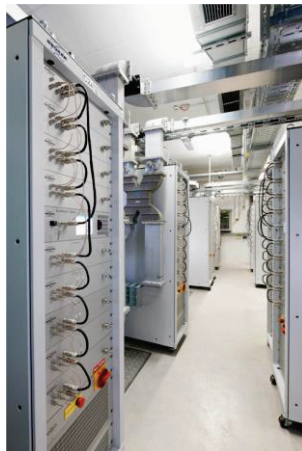
Figure 2: The new SSPA gallery at ELBE.