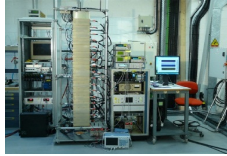
Figure 2: 500 MHz 10 kW unit prototype under long-term test at SOLEIL.

CW SSA is being built and will be tested on a dummy load, by the end of 2014 at SOLEIL.