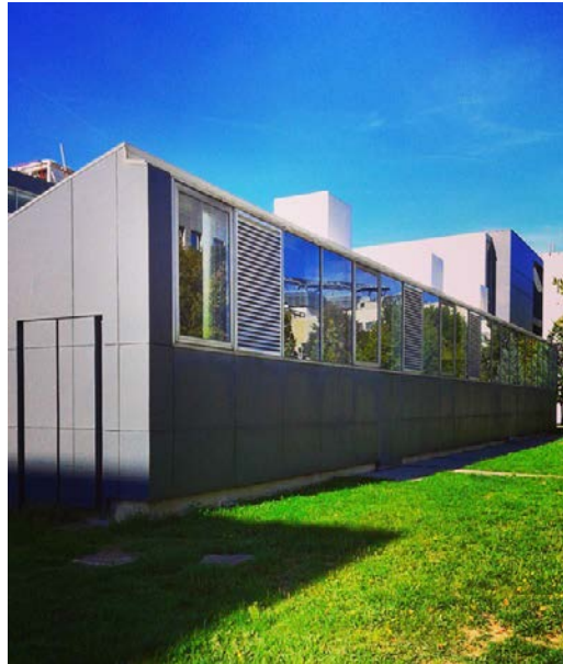
Figure 5: Photograph of the facade after the installation was completed. Intake air grills replaced three windows and white cubes were built for the exhaust vents.

No relocation of racks or equipment was needed, since the underfloor cold air scheme was not changed. The ceiling was constructed and the free-cooling units were pre-installed in the reclaimed office space with both computer rooms fully functional. The yearly 24 hour scheduled downtime was used to remove the old CRAHs, couple the free-cooling unit air ducts and interface the chilled water. The plastic lame curtains were installed progressively after the shutdown, with both computer rooms fully functional again. Thus, this major cooling system upgrade was accomplished with no additional downtime .