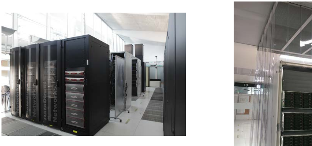
Figure 2: Original open high-ceiling room (left) and detail of false ceiling with grill over hot aisle delimited by plastic lame curtains (right)

where high humidity conditions occur often and the surrounding area has greenery which can produce large amounts of pollen and loose leaves at certain times of the year.