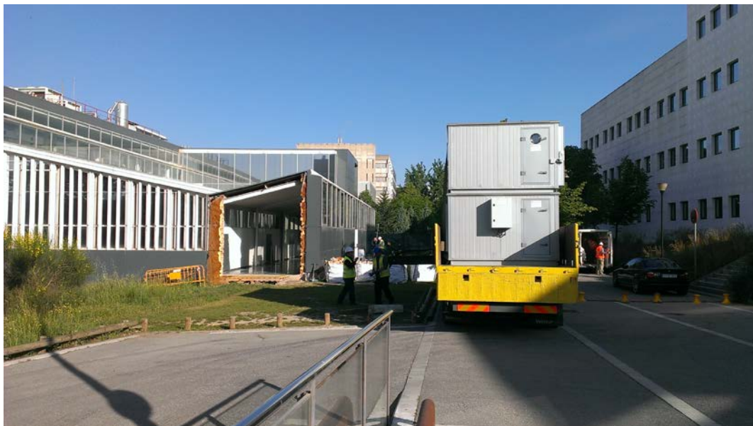
Figure 4: Photograph of the arrival of one of the free-cooling units. The reclaimed office space can be seen through the opening left by the removal of the outside wall. The computer room occupies the area directly on the left, with a sloping roof rising towards the left.