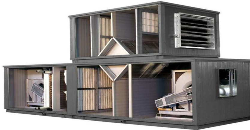
Figure 3: Free-cooling equipment from Tecnivel. Exterior air flows through the top and computer room air through the bottom.