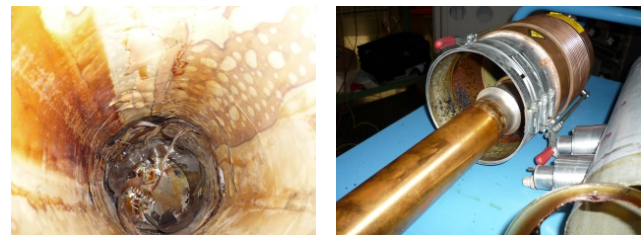
Figure 2: Klystron based transmitter ageing: damaged insulation of the linear HV transformer laminated core and burnt klystron output coaxial line.

Another cause of long recovery time from failure is the klystron replacement. The average lifetime of a 60 kW klystron is 32000 hours. Due to the expensive cost of this spare part it was decided to keep the klystron in operation up to its fatal break or considerable loss of performance with no prearranged replacement. The money saving was paid off with some unavoidable RF downtime but it should be recalled that, after the fatal klystron trip, it was permitted to operate with three RF stations instead of four during the klystron replacement.