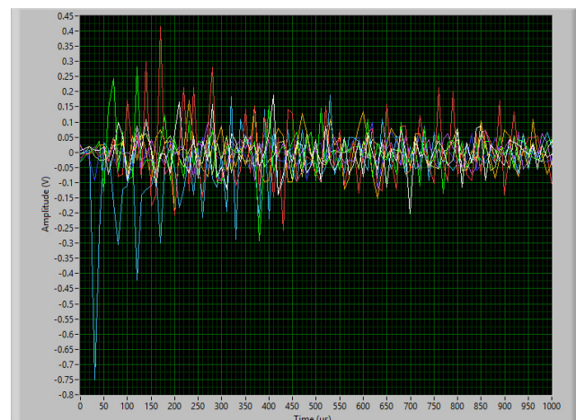
Figure 2: Strongest Modular Cavity spark signal (1 ms).

First, the signals had relatively large amplitudes at the beginning for around 50 \mu\text{s} and decayed quickly to zero in around 300 \mu\text{s} . The RF pulse duration for the MICE cavity is around 400 \mu\text{s} . A typical breakdown event will have an RF pulse cut short by about 100 \mu\text{s} . Given the noise subtraction artifact issue, this 100 \mu\text{s} is enough time to completely hide any meaningful acoustic signal from the MICE cavity. This potentially explains why we don't see strong acoustic signals in the captured data.