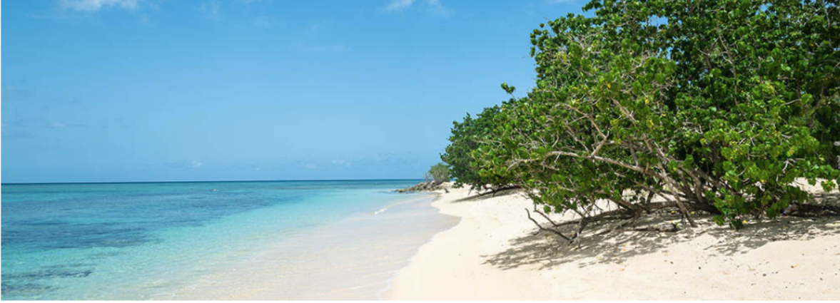
Figure 1: Guadeloupe Islands.