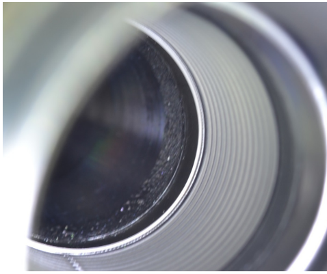
Figure 1: Peel-off.

Adhesion was also good for most of the chambers, being the VA type the only exception. For the three VA chambers treated, in independent runs, peel-off was observed at exactly the same place: after a weld between bellows and a short sleeve, around 2 cm in length, and on the flanges to a lesser extent. The outcome from an optical inspection with an endoscope (see Figure 1) has supported evidence for variation of the mechanical inner surface texture in the sleeve that coincides with the peel-off area. X-ray photoelectron spectroscopy was used to analyse the back of the coating that was in contact with the aluminium surface but no relevant contamination was found that could explain the poor adhesion. Since no wet chemical etching could be applied in order to remove the NEG in the whole chamber, due to the risk of trapping corrosion active elements in the bellow, the coating on the zones with peel-off was removed mechanically. The chamber was then bombarded with Krypton ions at approximately 400 eV at a dose of 2.8 \times 10^{-3} \text{ C/mm}^2 , and then recoated with NEG without air exposure in between. The peel-off persisted, indicating the origin of the problem is not related with last layers of the aluminium surface. Since both the short sleeve and the flanges have the same turned mechanical surface finish, and the other parts are honed, except the bellow, we suspect this surface finish may be linked to the lack of adhesion.