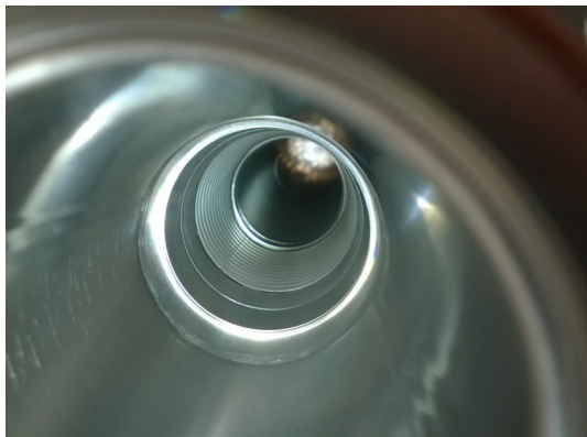
Figure 3: NEG coating of second series chamber with new surface treatments.

Figure 3 shows the NEG coating on the second set of chambers after implementation of the new etching and cleaning methods as mentioned above. Peel-off is not observed, and a constant surface finish can be seen.