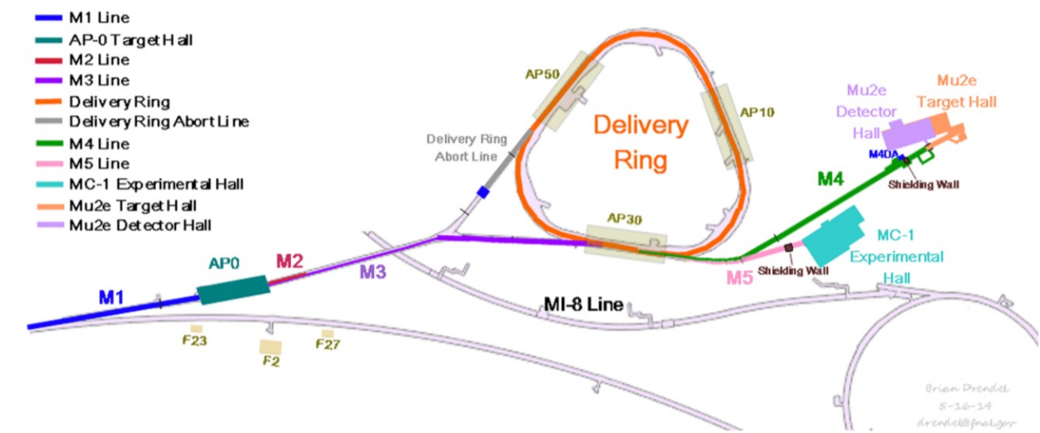
A schematic of the FNAL Muon Campus Accelerator.