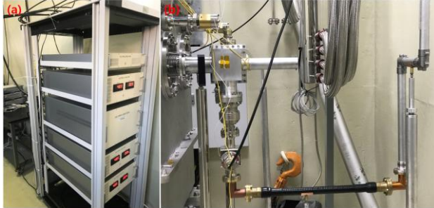
Figure 4: RF test of a HWR cryomodule. (a) SSPA and (b) the connection of a coaxial line to a power coupler in the cryomodule.

Coupler radio frequency (RF) conditioning is performed for about 8 hours with 400 V DC bias at room temperature. In order to cool down the cryomodule, liquid nitrogen is supplied to the thermal shield and then liquid helium is supplied to the helium reservoirs. The initial liquid helium path to cool down the cryomodule is from helium inlet to 4 K reservoir, 2 K reservoir and then helium outlet. By