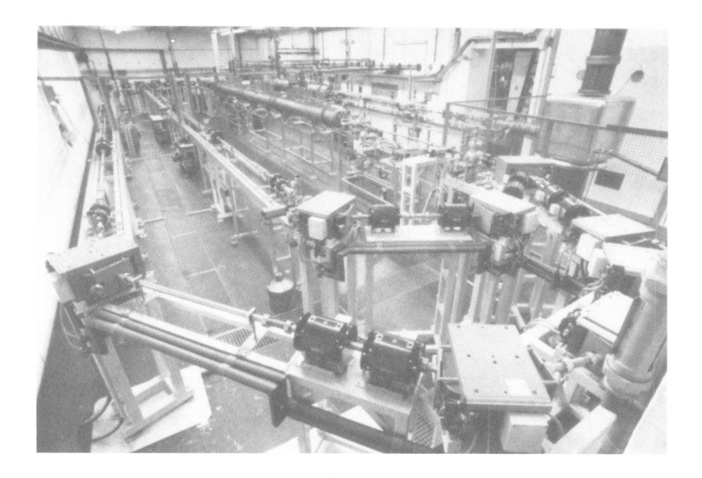
FIGURE 1 View of accelerator from the extraction side

The photograph of Fig. 1 gives an impression of the present accelerator installation. The electron gun at a potential of - 250 kV (right upper part of the figure) produces a dc beam which is chopped and prebunched in the room temperature part of the