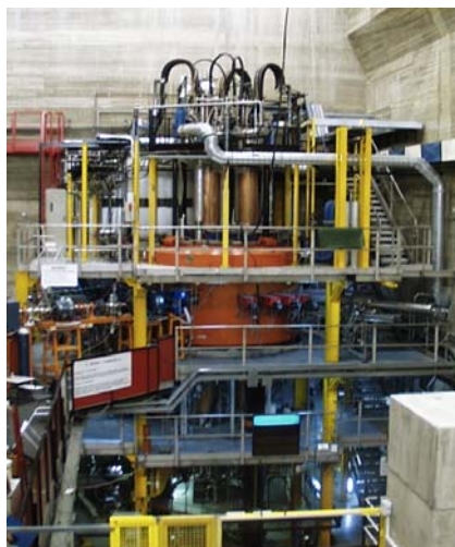
Fig.2: A view of K800 Superconducting Cyclotron at Laboratori Nazionali del Sud in Catania.

The present limit of low beam current we have experienced both for the CS accelerator and for the MAGNEX focal plane detector must be sensibly overcome. For a systematic study of the many “hot” cases of \beta\beta decays an upgraded set-up, able to work with two orders of magnitude more current than the present, is thus necessary. This goal can be achieved by a substantial change in the technologies used in the beam extraction and in the detection of the ejectiles. For the accelerator the use of a stripper induced extraction is an adequate choice. However, with the present set-up it is difficult to suitably extend this research to the “hot” cases, where \beta\beta decay studies are and will be concentrated. For the spectrometer the main foreseen upgrades are: