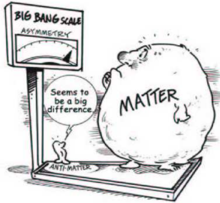
Figure 2: One rather weighty consequence of CP-violation.

The last point I would like to stress in this note is the truly cosmic implication of CP-violation: as Sakharov has shown in 1967 5) , the fact that the Universe is dominated by matter, and antimatter suspiciously absent, can only be explained if