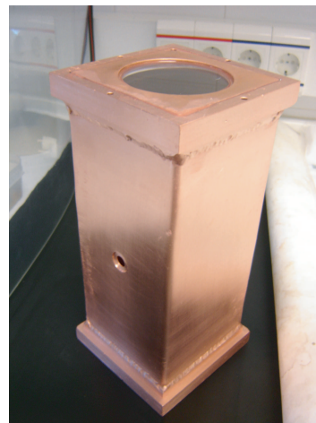
Figure 2. One of the ANAIS prototypes.