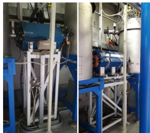
Figure 3: Photo of the old type of triplets (20 T/m, left) and the new one (30 T/m, right).