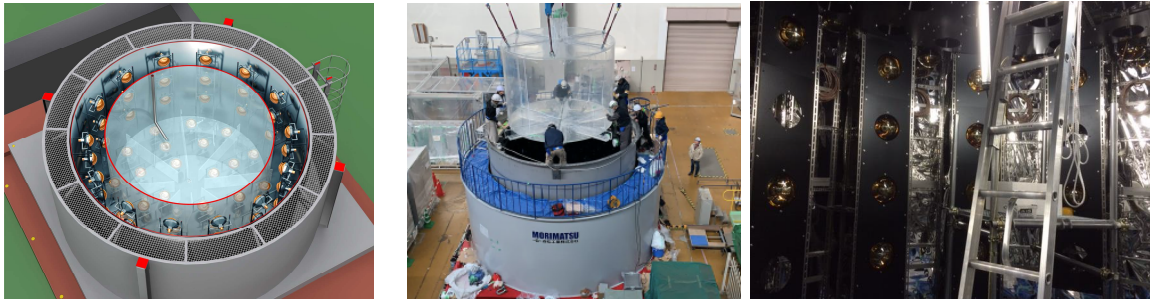
Figure 1. Left: JSNS 2 detector schematics; Middle: JSNS 2 detector in the HENDEL assembly hall and test installation of acrylic tank; Right: Inside tank with partially installed PMTs.