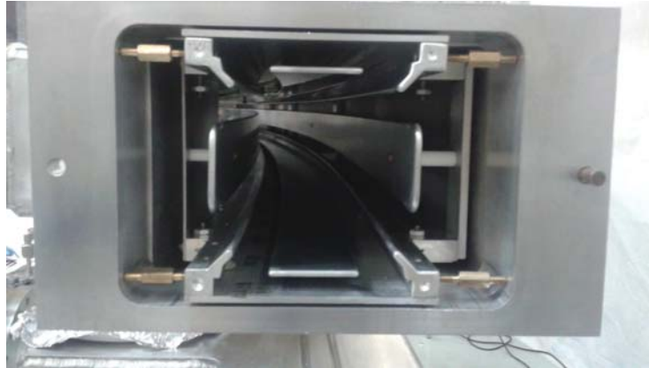
Figure 1. View of the cage with trolley rails and (most interior) four electrostatic quadrupole plates, from a vacuum chamber end flange.

work in tandem to keep the muons in the proper location. There are other beam related parts like the inflector, kickers, collimators and a beam monitoring system, as well as a trolley that rides around inside of the ring to measure the field. Detector systems include both straw trackers and lead crystal calorimeters. Trackers were not used in the BNL experiment and should add valuable information to the new g-2 data. Additionally, the calorimeters now have multiple read out channels to reduce pileup.